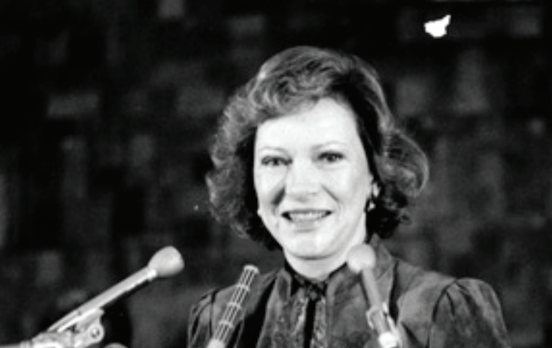
Former First Lady Rosalynn Carter addresses the IS Conference in 1985.