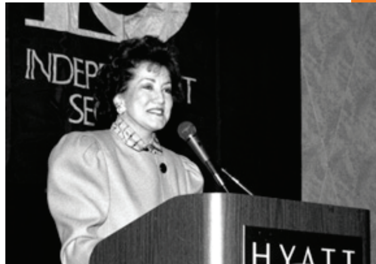
Senator Elizabeth Dole, then-president and CEO of the American Red Cross, speaks at the 1992 IS Annual Conference.

IS helps to create CIVICUS — an international alliance dedicated to strengthening citizen action and civil society.