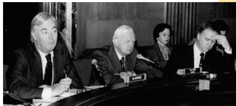
Senators Moynihan, Byrd and Packwood hear testimony in 1980 favoring the nonitemizer deduction for the charitable contributions.