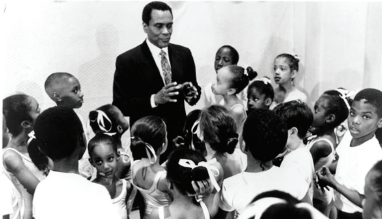
Arthur Mitchell, founder of the Dance Theatre of Harlem, was the 1996 recipient of the John W. Gardner Leadership Award.

The “ Istook Amendment ,” named after its chief sponsor, Congressman Ernest Istook (R-OK), poses a serious threat to nonprofit advocacy; again, IS provides leadership to a large, diverse nonprofit coalition eventually defeating the bill.